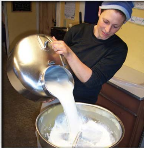
Fresh Milk in Small Quantities

We deliver through our MILK SHARE program and sell milk at our self-serve farmstand in Hinesburg, Vermont.